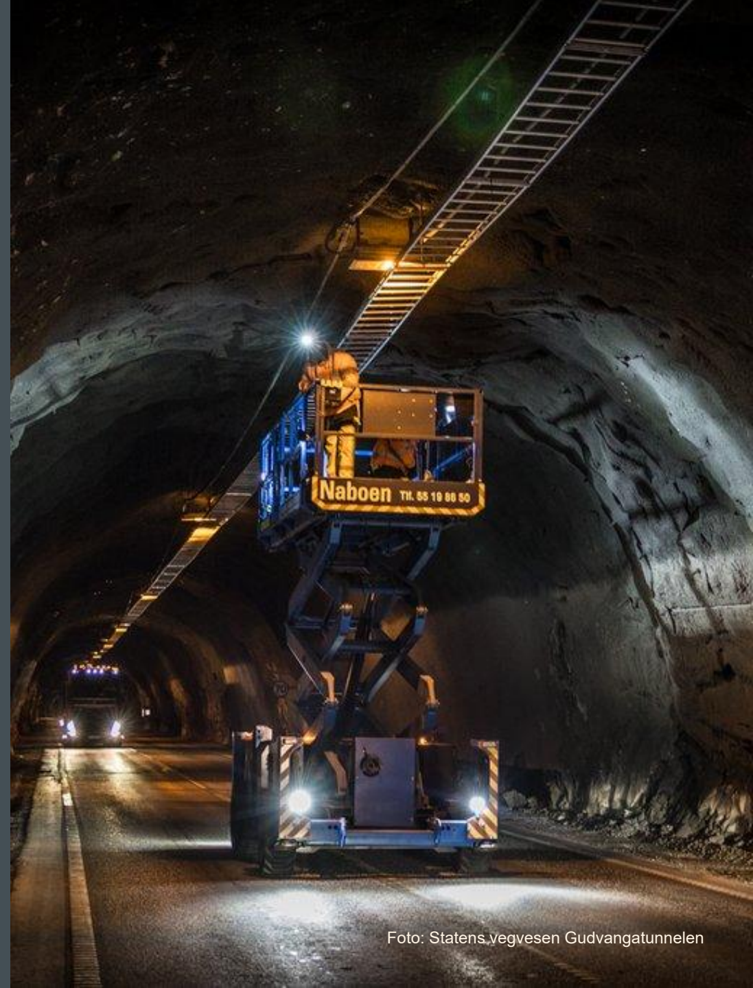
Gudvangatunnelen