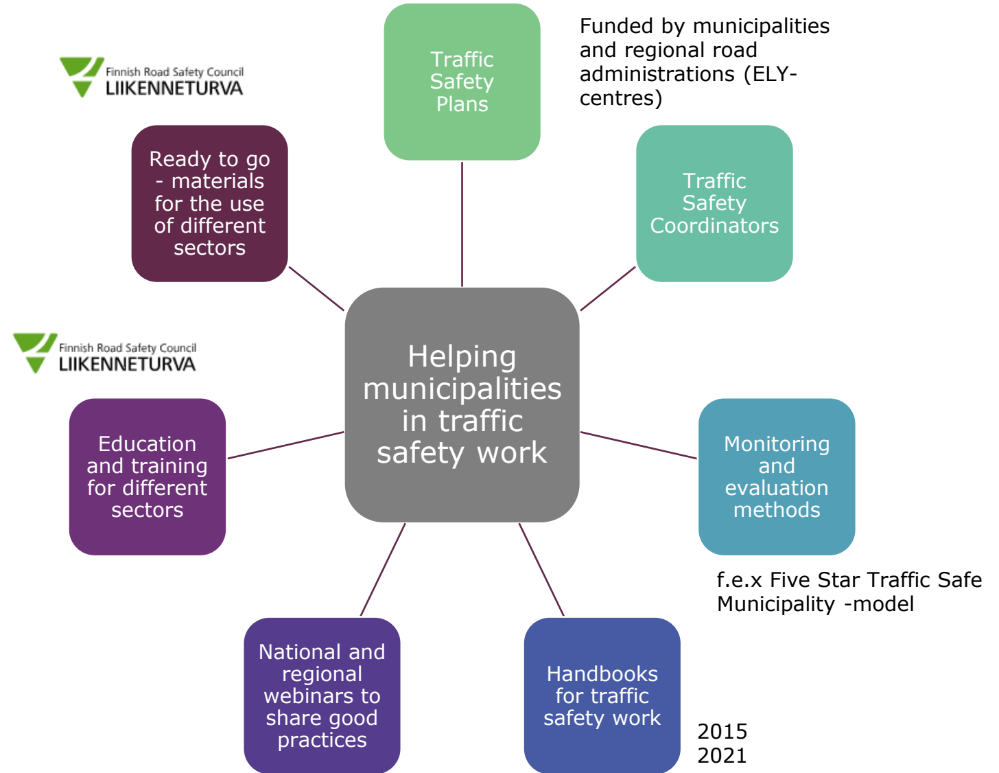
Picture: Some of the tools already in place to support municipalities in traffic safety work